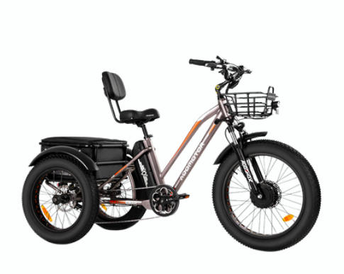
Seniors Trikes & Bikes